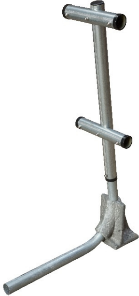
Free Standing Leg