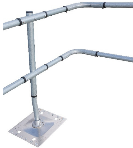
Corner Unit on Top Fix