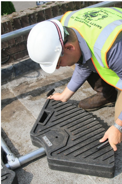
Weight and Double Weight Connector